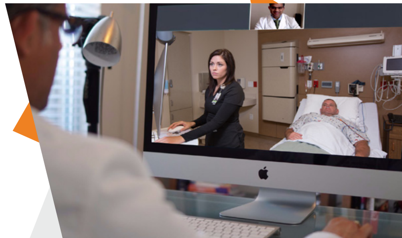
The Access Physicians telecardiologist has a clear view of the patient.