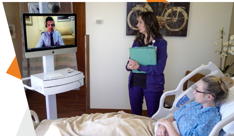
The Access Physicians telecardiologist conducts patient history and discusses symptoms.

Through the partnership, Cuero Regional connects with an Access Physician, board-certified cardiologist via secure, high-resolution technology in minutes. Four dedicated telecardiologists are assigned to the hospital. On-site nurses and health care providers and other physicians have access to the highest level of consultation on-demand to diagnose, treat and manage patients with congestive heart failure, arrhythmias and other heart-related conditions.