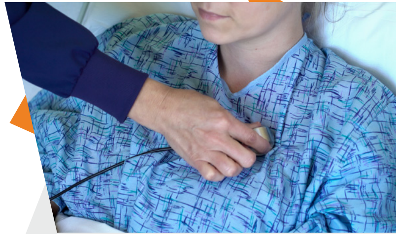
With the digital stethoscope, the telcardiologist hears heart and lung sounds.

Patients are thrilled with the telecardiology service, with one expressing her delight in having the telecardiologist’s undivided attention throughout the encounter. The telemedicine consult is focused, one-on-one quality time with the physician.